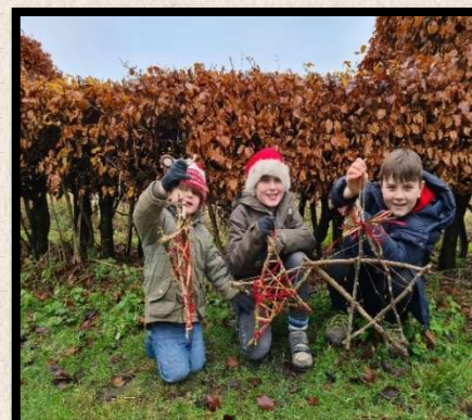
Children celebrating Christmas at Low Barns