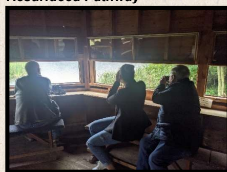
Corporate days with local businesses.