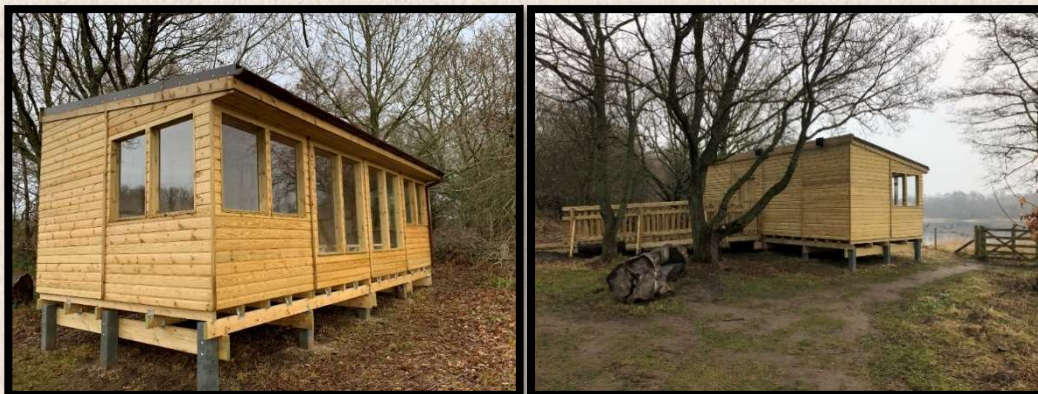
'The Den' overlooking Marston Lake