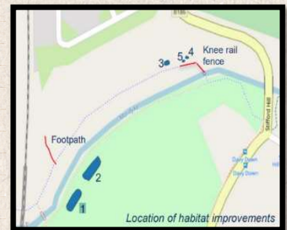
A diagram showing new changes