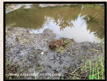
Newly excavated pond