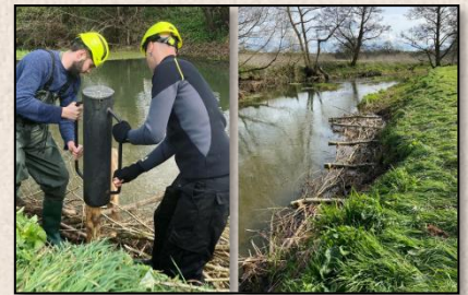
Volunteers installing a woody ledge along the river