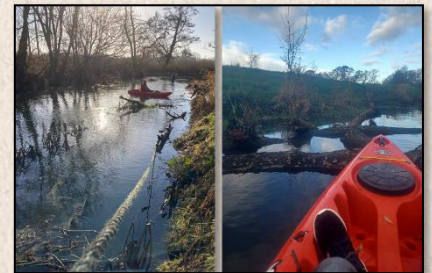
Trained River Wardens surveying and identifying areas for improvement.