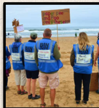
BinTheWipe public engagement event.