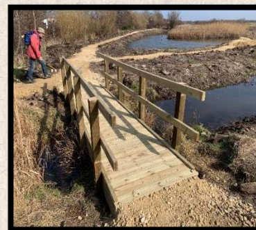
Timber footbridge construction at Coatham