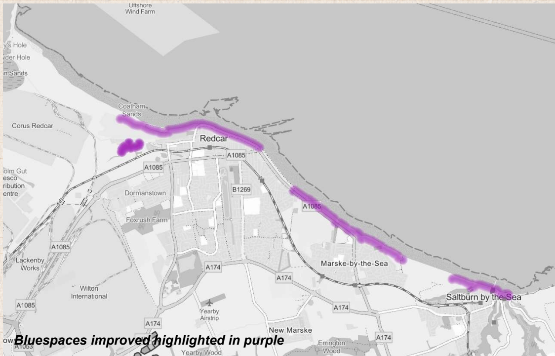
Bluespaces improved highlighted in purple

9.3km of Bluespaces along the Tees coastline and associated coastal streams has been improved through the Wilder Coast Project in 2021 and 2022. A new Wilder Coast Project Officer has been working across the area, bringing a renewed focus. This work has involved the protection of internationally important coastal birds including their feeding and nesting habitats. 1166 customers have been engaged throughout the project, by means of environmental activities and educational events. The continuation of the project until 2024 will deliver further improvements and a lasting impact across this often-overlooked area of the North East coast.