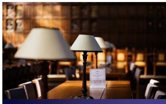
“A good cost assessment should lead to an accurate estimate of the efficient cost level...”

In PR14, Ofwat ultimately required companies to submit evidence that their costs would be subject to input price inflation and provide inflation forecasts. Companies in the upper quartile of efficiency according to Ofwat’s unit cost models and that also met other criteria, were set a cost allowance that took account of input price inflation. The sum is fixed and does not depend on outturn input price inflation and therefore they bear input price inflation risk.