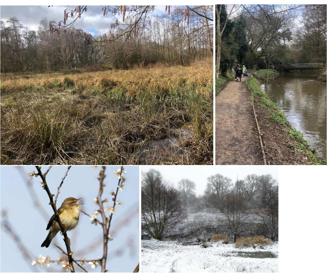
Images taken by visitors and volunteers over the past year at Frenze Beck

Additional funds from ESW have provided facilities to support bird nesting and visitor enjoyment of the water environment at this site, through the provision of bird boxes, seating and an interpretation board.