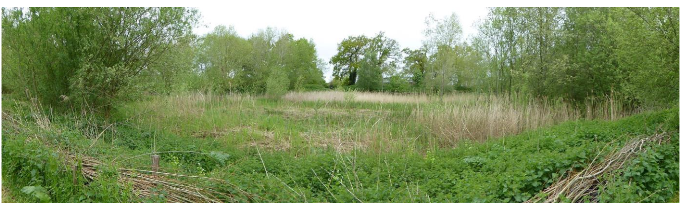
Area of reed cut for habitat management