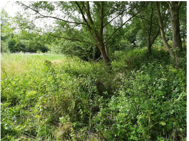
Removal of non-native Hemlock from the site