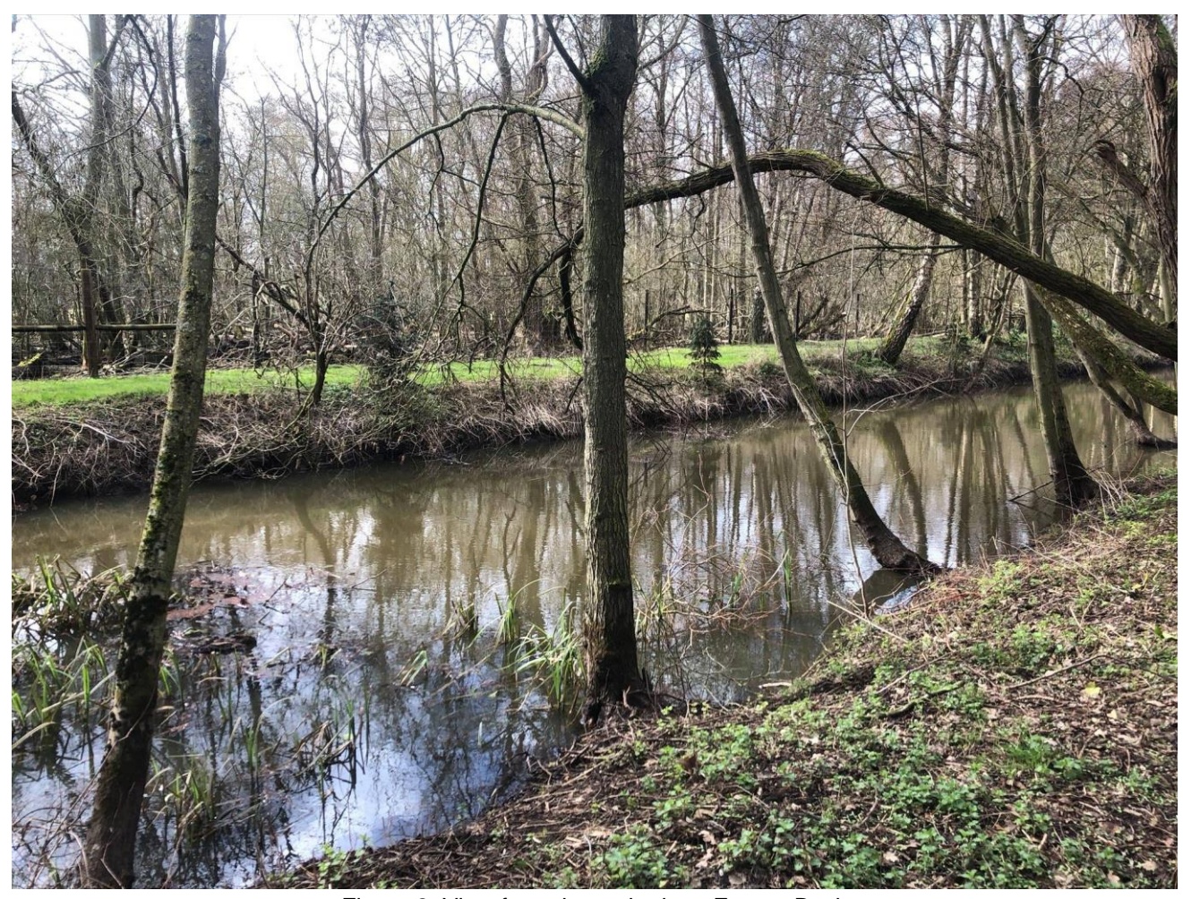
Figure 2: View from the path along Frenze Beck