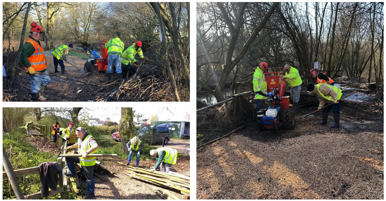
Contractors and volunteers creating new habitat and boardwalks along the riverside and connecting paths

New interpretation now provided at the site