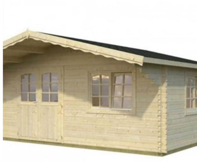
Ground works in place and cabin for the new Osprey watch facility procured