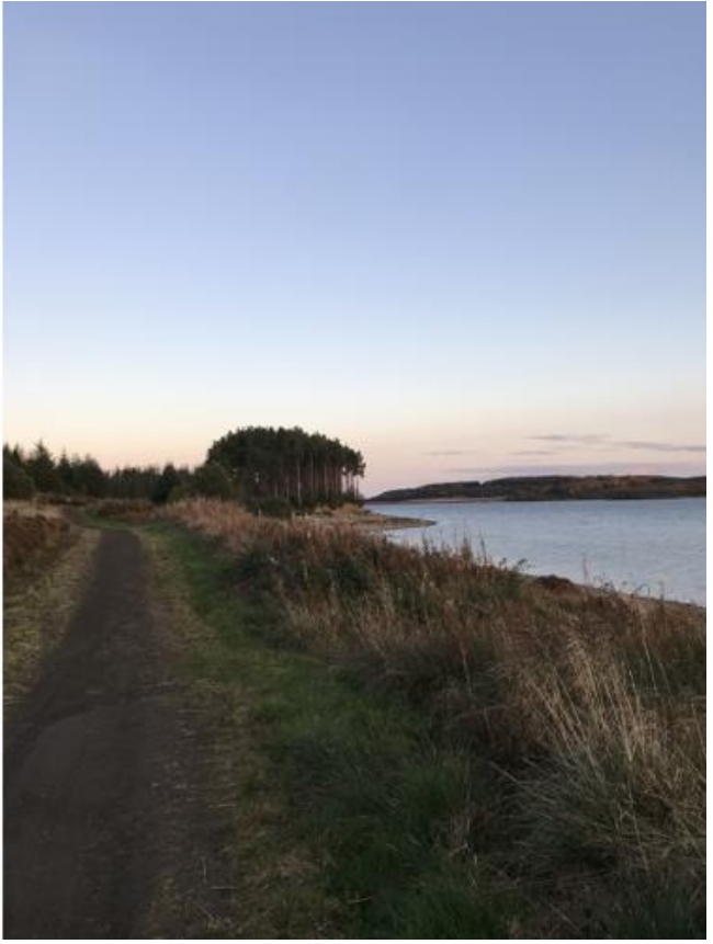
Resurfacing works along the Lakeside Way – two example locations where surface improvements have been carried out