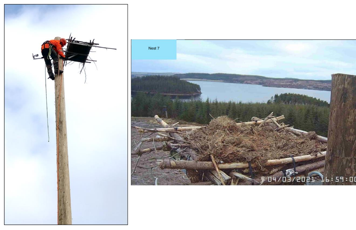
Figure 2: Installation of the new camera and Osprey nest protection at Kielder Water