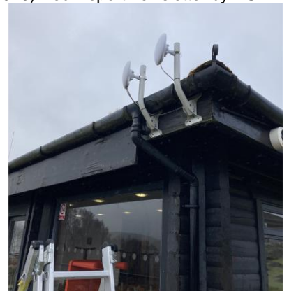
Solar panels, radio mast, control box and receivers for Osprey Watch