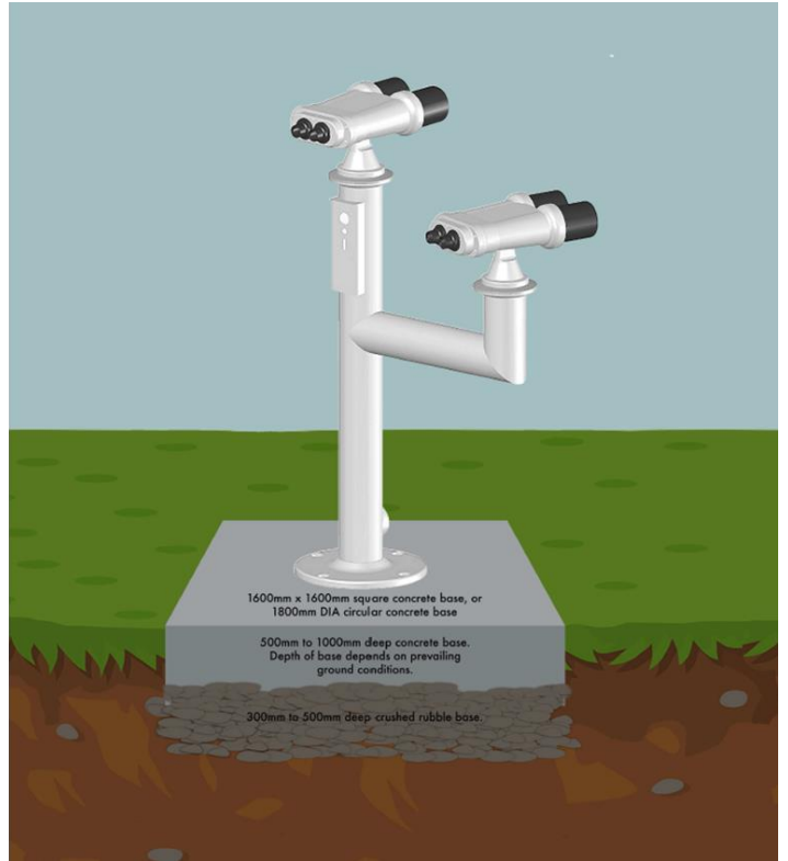
Example of new signage installed along Lakeside Way and a representation of the all access telescope for Osprey watch