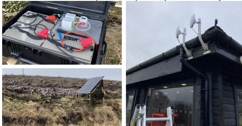
Solar panels, radio mast, control box and receivers for Osprey Watch