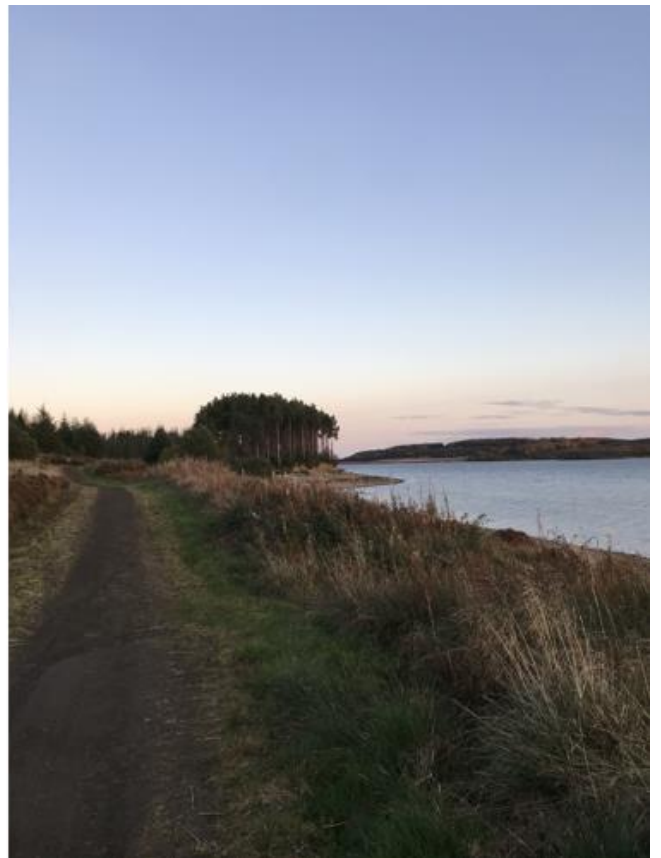
Resurfacing works along the Lakeside Way – two example locations where surface improvements have been carried out