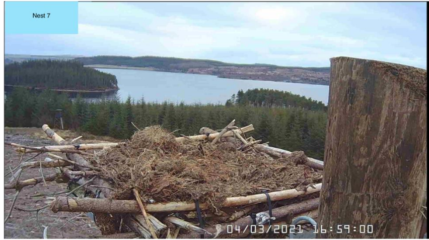
Figure 2: Installation of the new camera and Osprey nest protection at Kielder Water